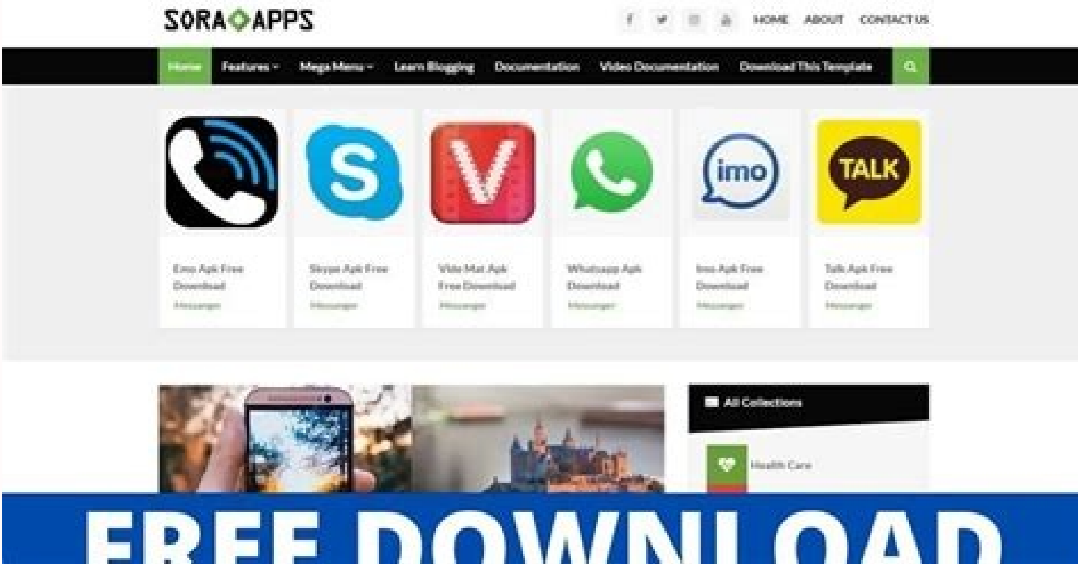
Blogger app apk.